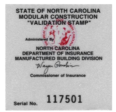
NC Modular Construction Validating Stamp